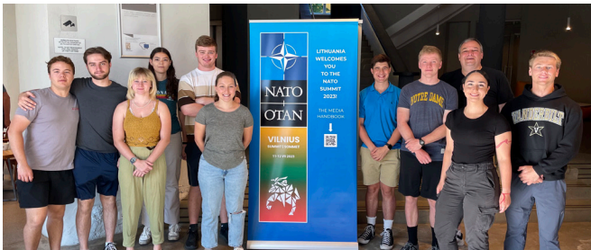
Students in Vilnius, Lithuania during the NATO Summit

Experience academic studies in a different context